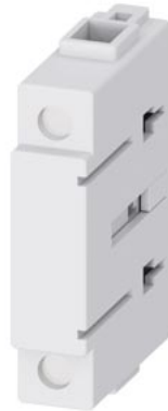
PE-through terminal, Front installation, accessory for Load disconnecter 3LD3