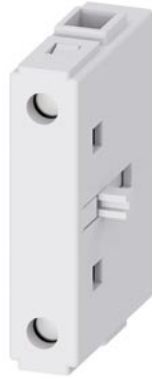
N switching contact, Floor installation accessory for Load disconnecter 3LD3