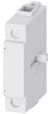
N switching contact, Front installation, accessory for Load disconnecter 3LD3