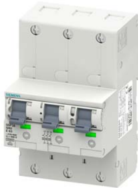
Main miniature circuit breaker (SHU), 3x 1-pole, E 63, 400V