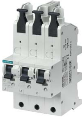
Main miniature circuit breaker (SHU), 3x 1-pole, E 63A, 230/400 V Mounting on 40 mm busbars