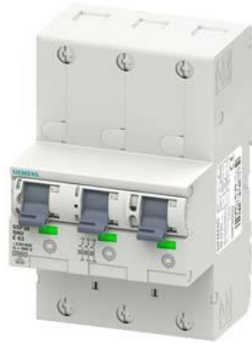
Main miniature circuit breaker (SHU), 3x 1-pole, E 20, 400V