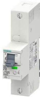
Main miniature circuit breaker (SHU), 1-pole, E 50, 230/400 V