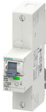
Main miniature circuit breaker (SHU), 1-pole, E 40, 230/400 V