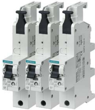
Main miniature circuit breaker (SHU), 1-pole, E 40A, 230/400 V (block with L1, L2, L3)