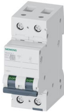
miniature circuit breaker 400 V 6 kA, 2-pole, C, 0.3 A