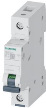
Miniature circuit breaker 230/400 V 6kA, 1-pole, B, 32 A