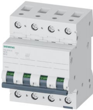
Miniature circuit breaker 400 V 10kA, 3+N-pole, B, 32 A