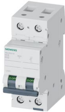
Miniature circuit breaker 230 V 10kA, 1+N-pole, D, 32 A