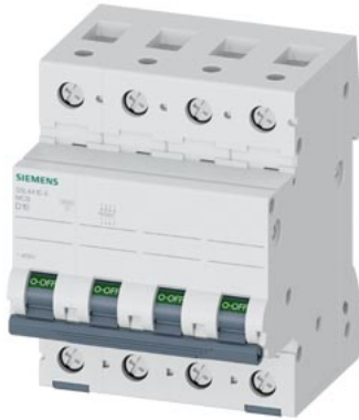
Miniature circuit breaker 400 V 10kA, 4-pole, D, 10 A