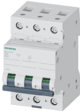
Miniature circuit breaker 400 V 10kA, 3-pole, D, 32 A