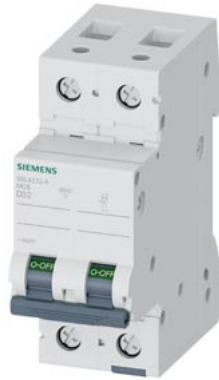
Miniature circuit breaker 400 V 10kA, 2-pole, D, 32 A