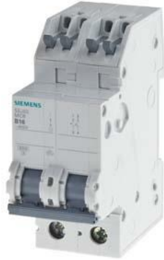
Miniature circuit breaker 230 V 6kA, 1+N-pole, C, 10A, D=70 mm with screwless outgoing terminals