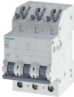
Miniature circuit breaker 400 V 6kA, 3-pole, B, 10A, D=70 mm with screwless outgoing terminals