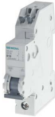
Miniature circuit breaker 230/400 V 6kA, 1-pole, C, 16A, D=70 mm with screwless outgoing terminals