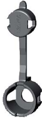
accessory for VT1000, VT1600 sealing screw