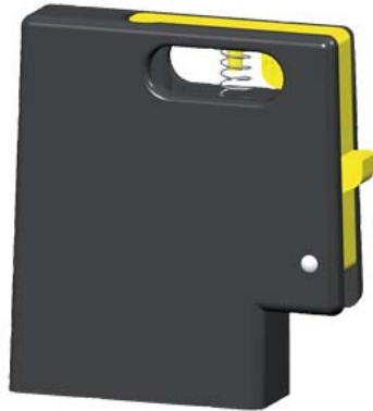
accessory for VT1000, VT1600 sliding bar