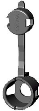
accessory for VT630, sealing screw