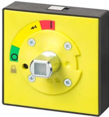
accessory for VT250, VT630 handle without locking black