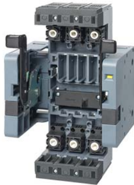
accessory for VT250 kit for withdrawable version front connection 3-pole