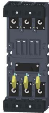
accessory for VT250 plug-in base, front connection 4-pole