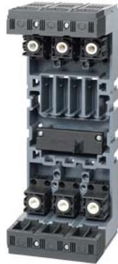
accessory for VT250 plug-in base, front connection 3-pole