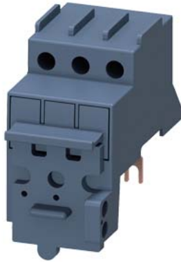
Disconnecter module for circuit breaker Size S00/S0