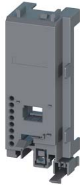
contactor base for contactor frame size S00 with screw/spring-loaded terminal (single-unit packaging)