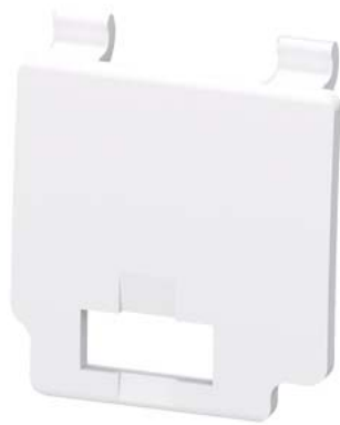
scale cover, sealable for circuit breaker 3RV2 Size S00...S3