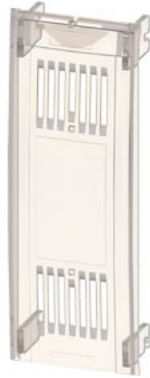
Replacement part for 3KF size 3 Fuse cover