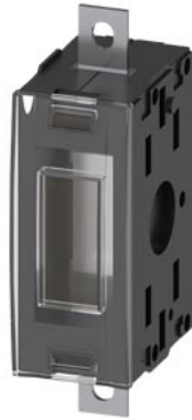
Accessory for 3KF size 3 Neutral conductor/ground terminal with fixed jumper flat terminal