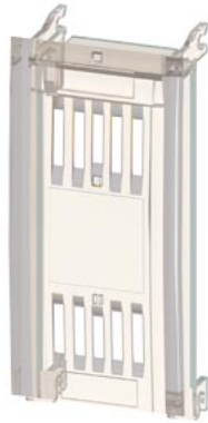
Replacement part for 3KF size 2 Fuse cover