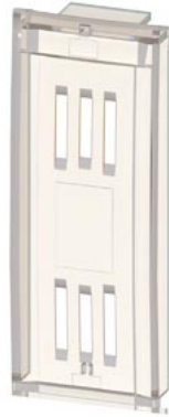
Replacement part for 3KF size 1 Fuse cover