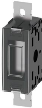
Accessory for 3KD size 4 Neutral conductor/ground terminal with fixed jumper flat terminal