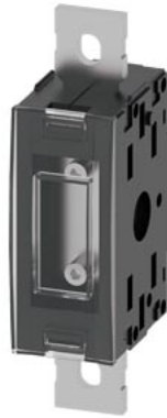
Accessory for 3KD size 4 Neutral conductor terminal with removable jumper flat terminal