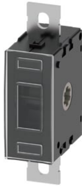
accessories for 3KD size 3, fourth pole, switchable, flat connector