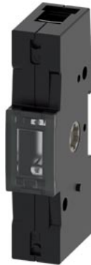
Accessory for 3KD size 2 Neutral conductor/ground terminal with fixed jumper Box terminal