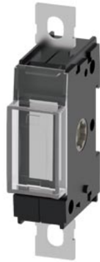
Accessory for 3KD size 2 Neutral conductor/ground terminal with fixed jumper flat terminal