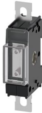
Accessory for 3KD size 2 Neutral conductor terminal with removable jumper flat terminal