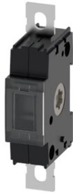
accessories for 3KD size 2, fourth pole, switchable, flat connector