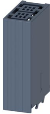
Accessory for 3KD size 2 Cable connection cover Standard length contains 6 units