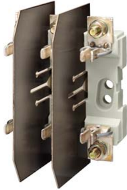
LV HRC fuse base Sz. 00, 3-pole 160 A 690 V (1000 V) Flat terminal, 95 mm 2