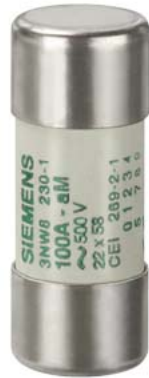
SENTRON, cylindrical fuse link, 22x58 mm, 100 A, aM, Un AC: 500 V