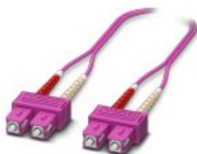
Multi-mode OM4 duplex jumper, SC-SC, UPC polishing, length 1 m

Please be informed that the data shown in this PDF Document is generated from our Online Catalog. Please find the complete data in the user's documentation. Our General Terms of Use for Downloads are valid ( http://phoenixcontact.com/download )