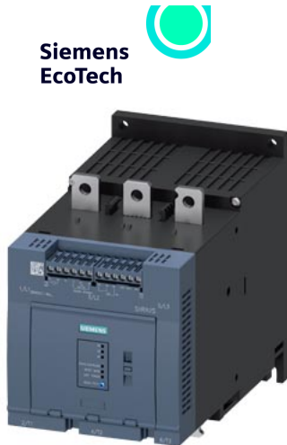
SIRIUS soft starter 200-600 V 370 A, 24 V AC/DC Screw terminals Analog output