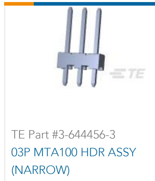
TE Part #3-644456-3 03P MTA100 HDR ASSY (NARROW)