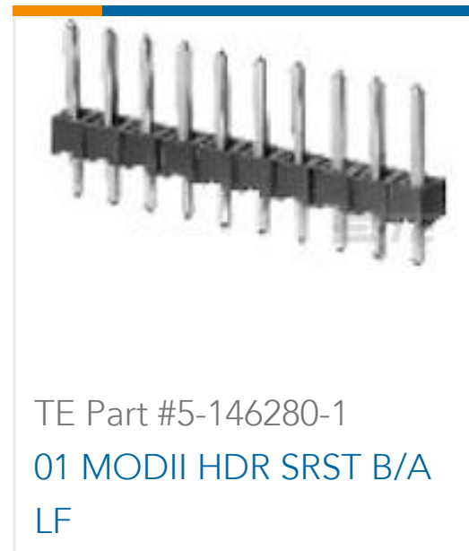
TE Part #5-146280-1 01 MODII HDR SRST B/A LF