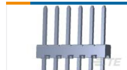
TE Part #3-644456-6 06P MTA100 HDR ASSY (NARROW)