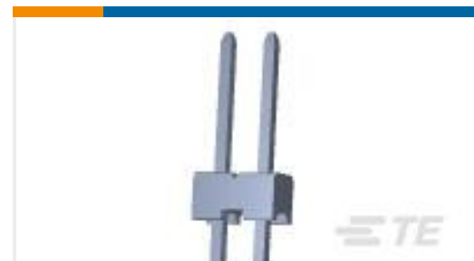
TE Part #3-644456-2 02P MTA100 HDR ASSY (NARROW)