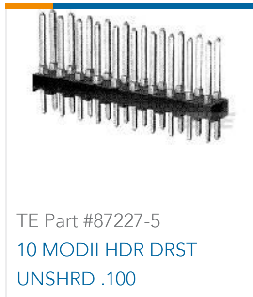
TE Part #87227-5 10 MODII HDR DRST UNSHRD .100