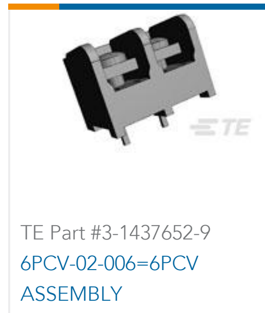
TE Part #3-1437652-9 6PCV-02-006=6PCV ASSEMBLY