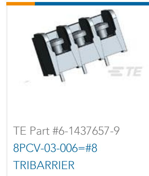
TE Part #6-1437657-9 8PCV-03-006=#8 TRIBARRIER