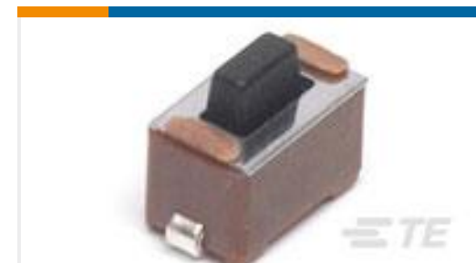
TE Part #1437566-4 FSMSMTR=TACT SWITCH