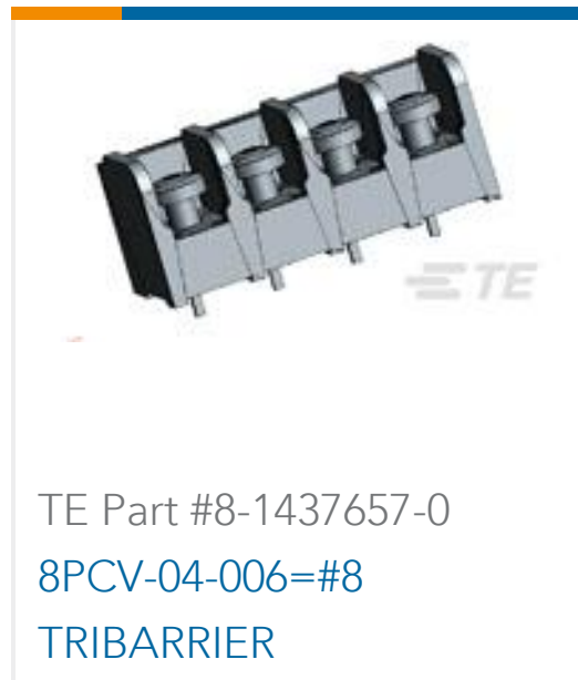
TE Part #8-1437657-0 8PCV-04-006=#8 TRIBARRIER