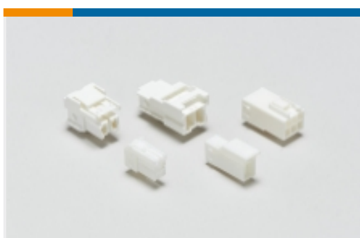
Rectangular Power Connectors(170)