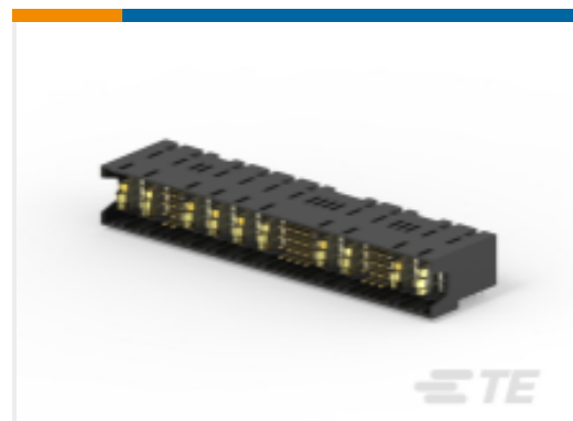
TE Part # 6450839-6 MBXLE R/A HDR 2ACP+8S+4ACP+16S+2ACP+12S+2ACP