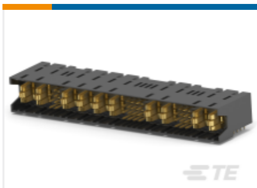
TE Part # 6450849-6 MBXLE 2ACP+8S+4ACP+16S+2ACP+12S+2ACP