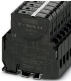
Electronic circuit breaker, reset input and status output, nominal current: 10 A

Please be informed that the data shown in this PDF Document is generated from our Online Catalog. Please find the complete data in the user's documentation. Our General Terms of Use for Downloads are valid ( http://phoenixcontact.com/download )