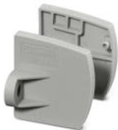
Flange, number of positions: 0, color: gray

Please be informed that the data shown in this PDF Document is generated from our Online Catalog. Please find the complete data in the user's documentation. Our General Terms of Use for Downloads are valid ( http://phoenixcontact.com/download )