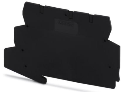
Illustration shows the black product version

http://catalog.phoenixcontact.net/phoenix/treeViewClick.do?UID=2856773